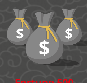
By the end of June 2015, there were 268 Fortune 500 companies established in Chengdu

of the world's laptops are tested in Chengdu